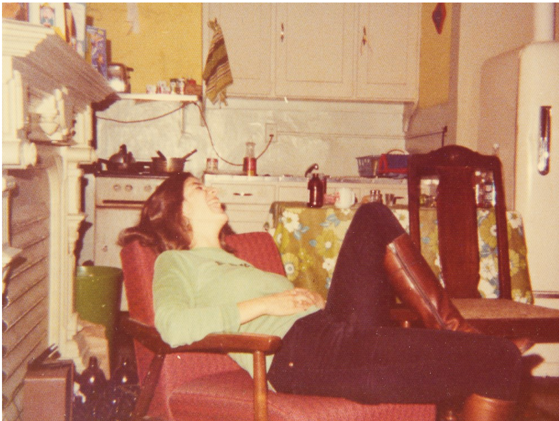
Having a laugh, date unknown. Perhaps while in college?