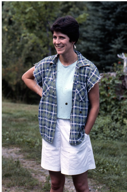
At "The Farm" in New Hampshire, one of her favorite places, date unknown