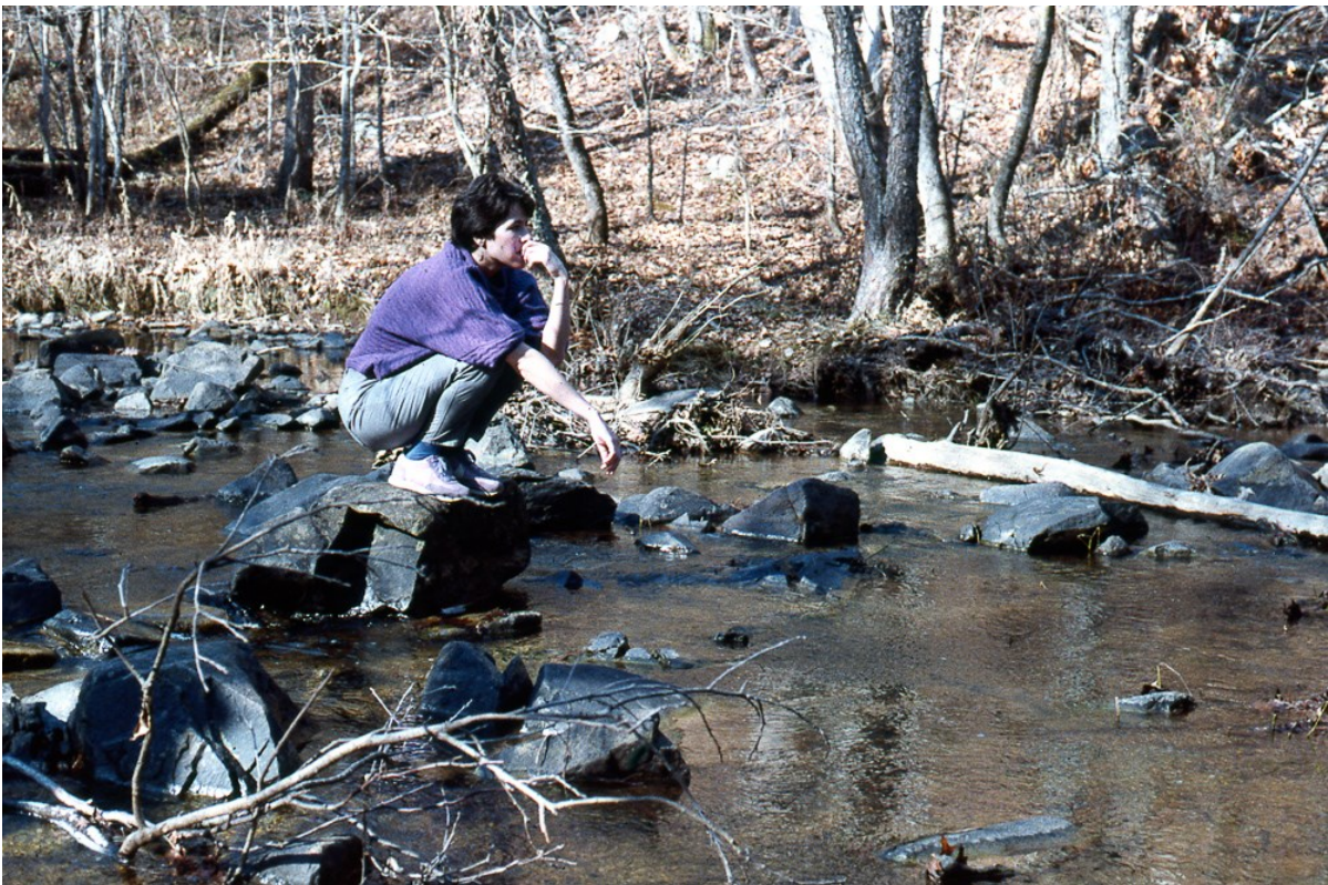
Exploring a river