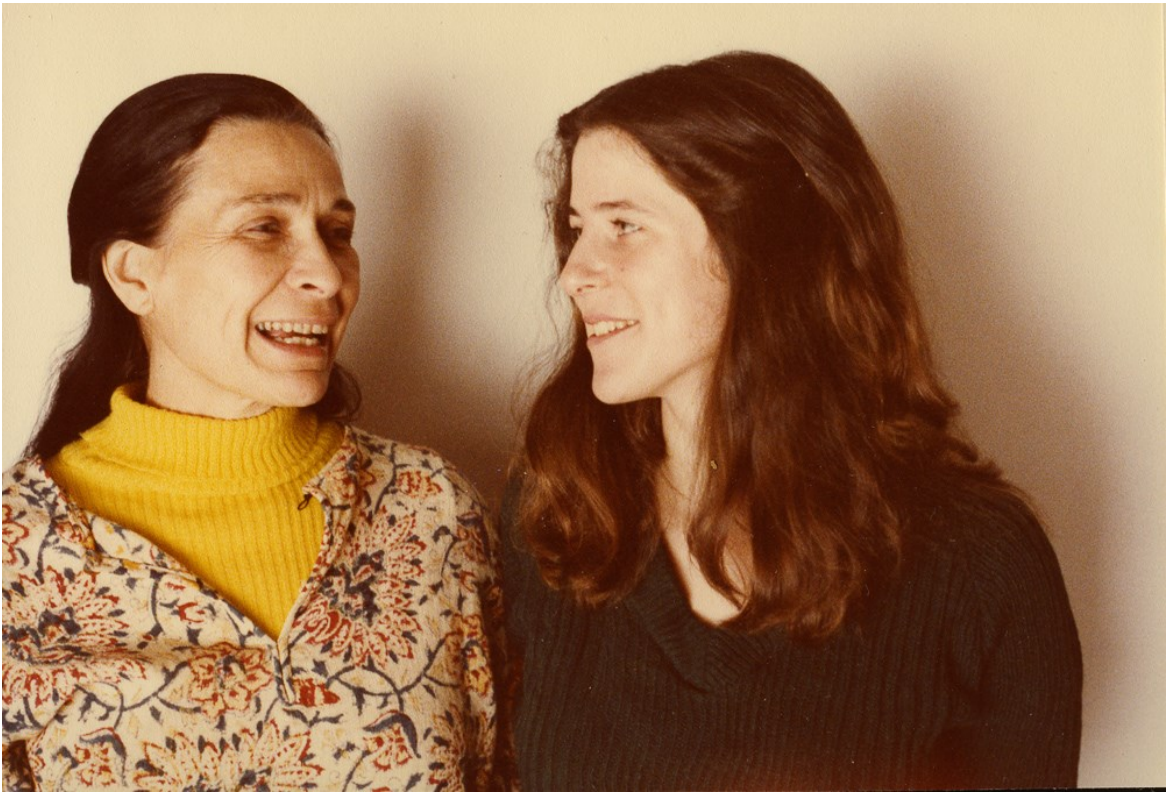
With her Mom