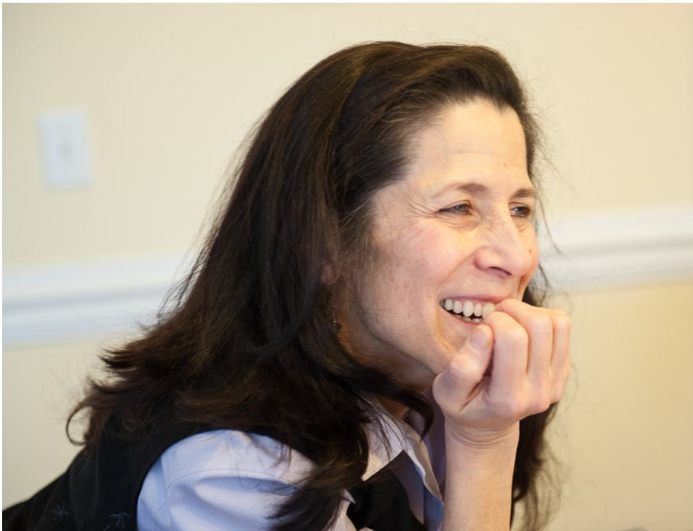
Happier days, 2010