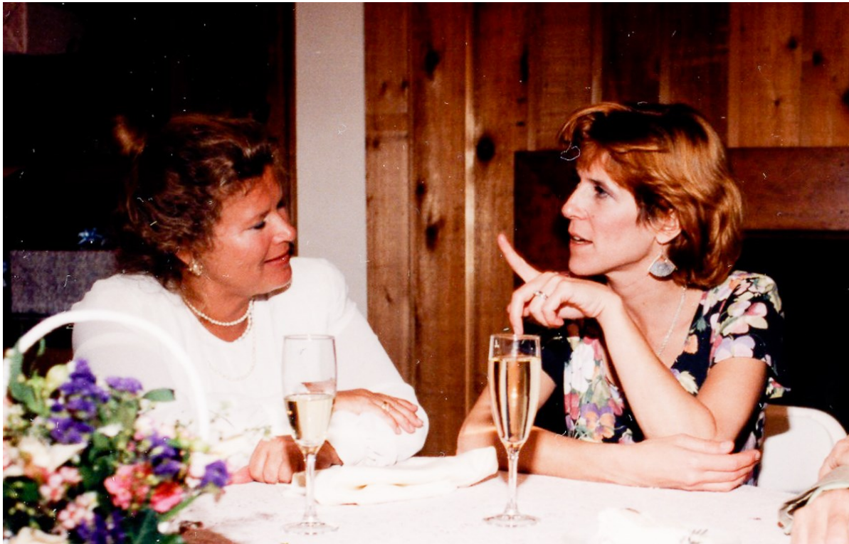
At a party making a very typical gesture, 1991