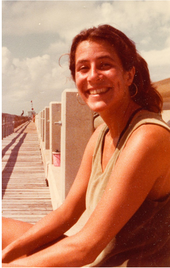
Date unknown, perhaps when she lived in Florida