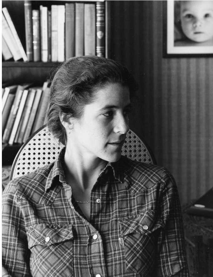
A more formal portrait, date unknown