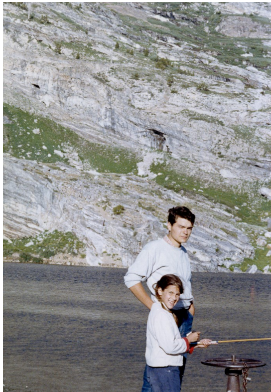
Fishing with her brother somewhere out west, summer 1964